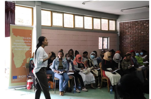
* Refugees receive business training in Ethiopia by IOM