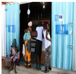
* A WFP-backed pop-up retail outlet in the Gorom refugee camp in South Sudan.

Currently the focus of the Fund is restricted only to businesses operating in Addis Ababa regional administration . Applicants must be able to evidence this.